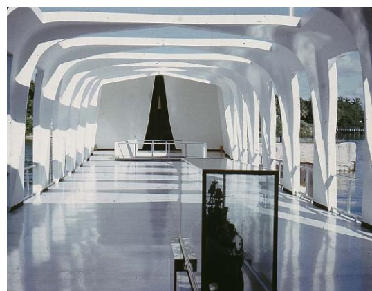
The USS Arizona memorial