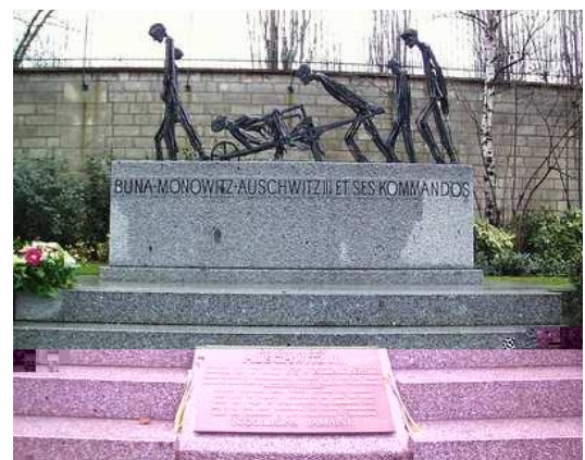
The Auschwitz memorial